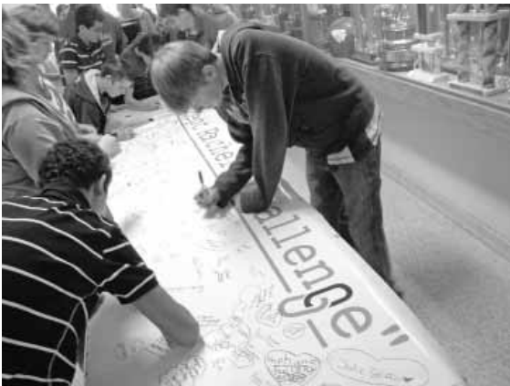
Seventh and eighth grade students sign the banner, pledging that they have accepted Rachel's Challenge.