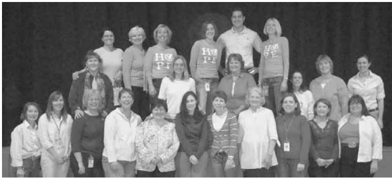
The Saranac Teachers' Association held a fundraiser in October to raise money for the FitzPatrick Cancer Center's Treasure Chests breast cancer support group. On Oct. 22, faculty and staff throughout the District wore pink to support breast cancer awareness. Pictured: Staff at Saranac Elementary School