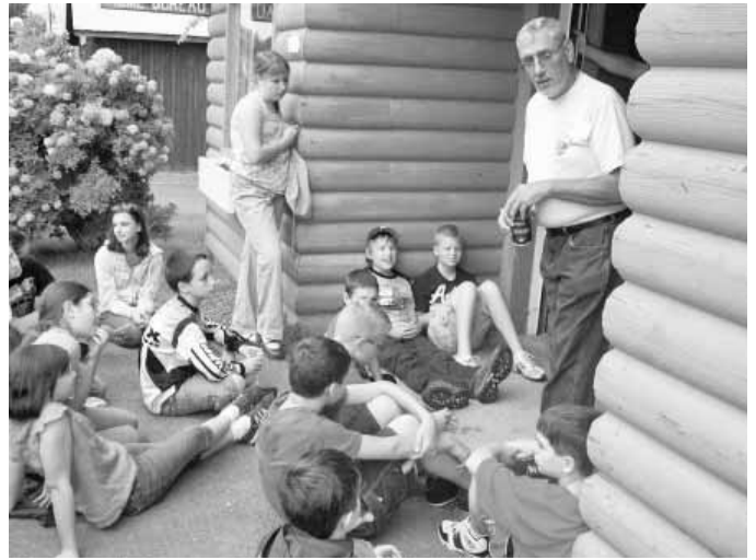
6th graders learn about the paper making process at a station of the Environmental Awareness Field Days.

Our sixth grade students participated in the annual Environmental Awareness Field Days held at the Clinton County Fairgrounds, sponsored by Cornell Cooperative Extension. They enjoyed learning about composting, wetlands, paper making and energy conservation. The students spent the day visiting various stations and learning new ways to protect and save our environment.