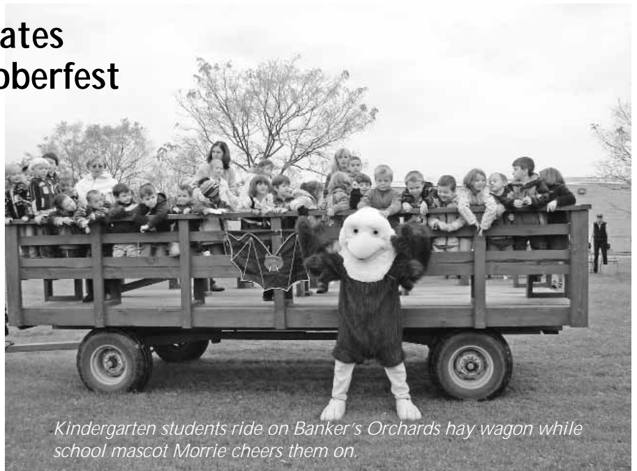
Kindergarten students ride on Banker's Orchards hay wagon while school mascot Morrie cheers them on.